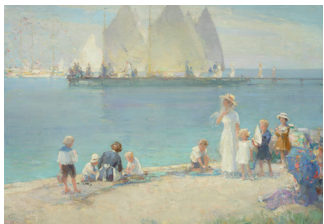
Walter Granville-Smith (1870–1938) Regatta Days (Long Island, New York) , 1915 Oil on canvas, 36 x 44 inches Bequest of Richard M. Scaife, 2015.90