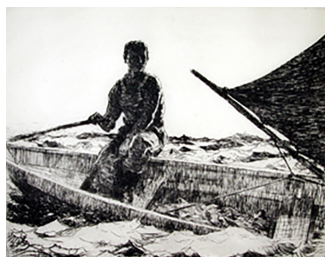
Frank Weston Benson (1862–1951) Dory Fisherman, 1927 Etching on Paper, 7 3/4 x 9 7/8 inches Gift of the Constance Mellon Bequest, 1985.164