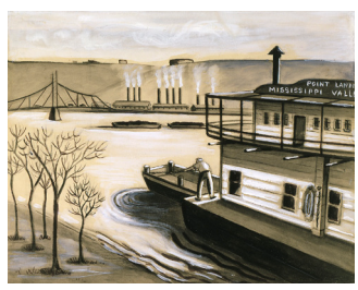
Thomas Wentzel (Primary) Untitled (River Scene with Barge), NO DATE Ink wash on paper mounted on cardboard, 10 1/2 x 13 1/4 inches Museum Purchase, 1996.23