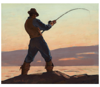
Gifford Beal Sea Bass Fisherman, 1940 Oil on board, 20 x 24 inches Anonymous Gift through the Westmoreland Society, 1995.51